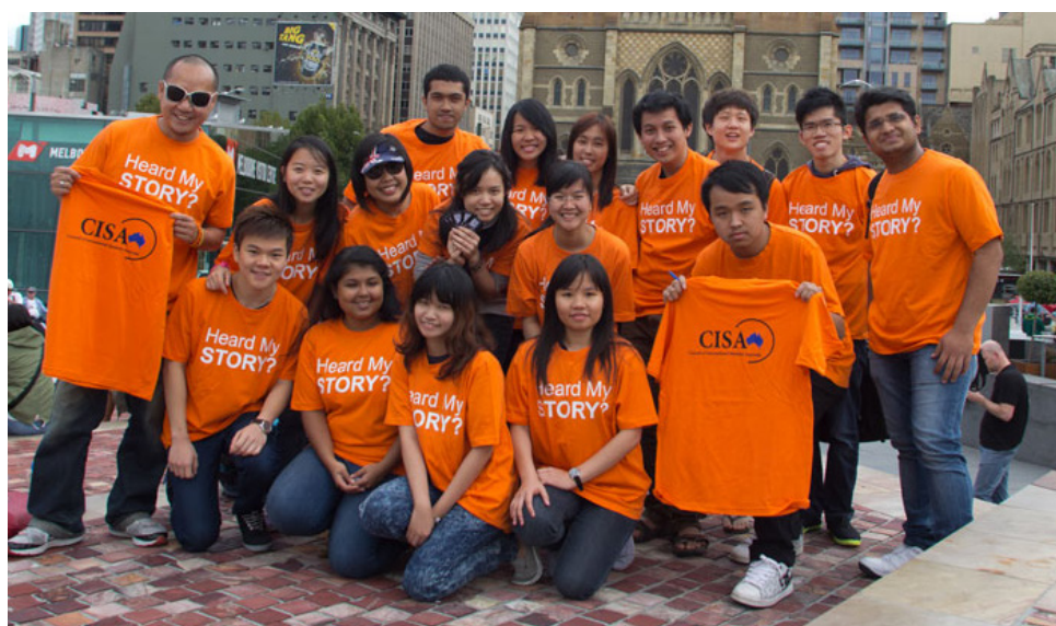
Students share their stories as part of the Council of International Students Australia's (CISA) 'I am not an Australian, but I have an Australian story' project (see right).

IEAA continues its lobbying efforts to ensure the key recommendations are implemented.